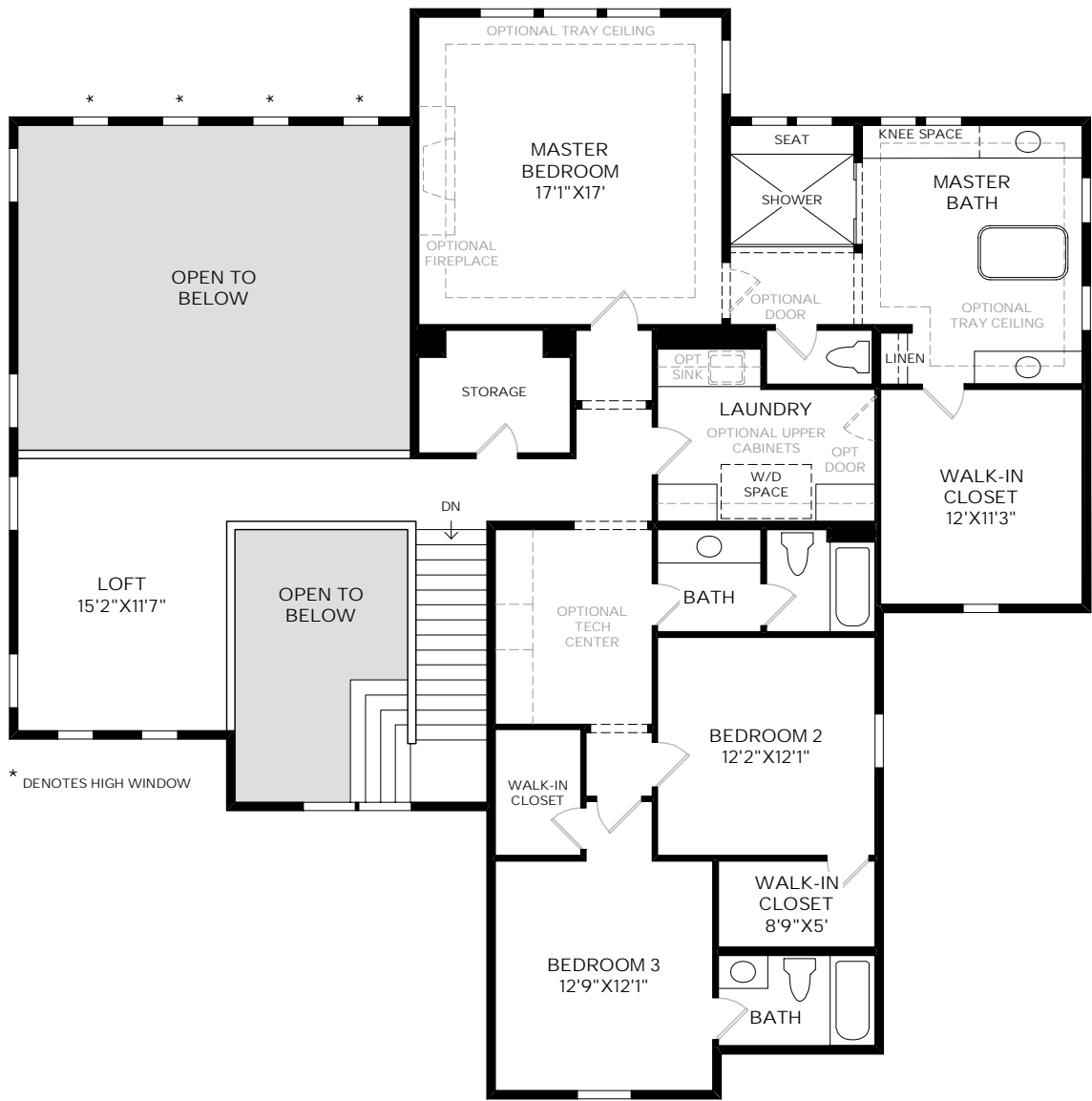
Second Floor 9' CEILING HEIGHT