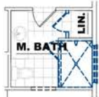
OPTION "A" 60"x42" SHOWER W/ LINEN CLOSET