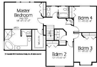
Upper Level 1240 Sq. Feet