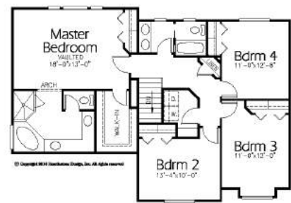
Upper Level 1240 Sq. Feet