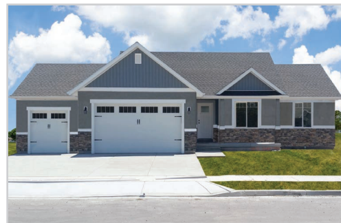
STONE AND STUCCO EXTERIOR ON FRONT ONLY