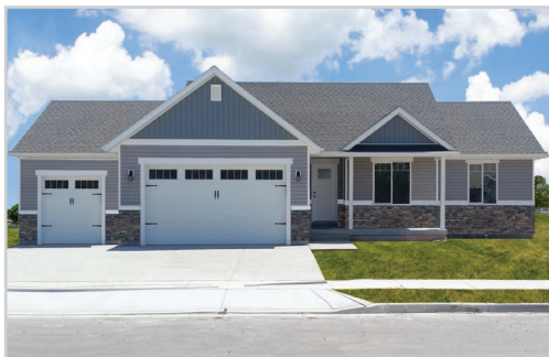
SIDING WITH 3 FT WAINSCOT AND 2 FT KICKBACK ON FRONT ONLY