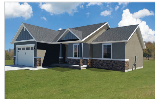
STONE AND STUCCO EXTERIOR ON ENTIRE HOME

Hardy/Stone options available upon request