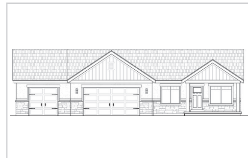
STONE AND STUCCO EXTERIOR ON ENTIRE HOME

Hardy/Stone options available upon request