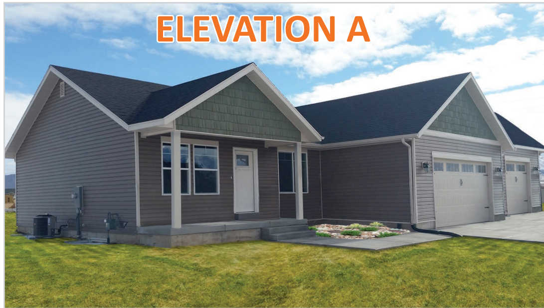
ELEVATION A - IS FULL SIDING WITH BOARD & BATTON ON THE EAVES AND IS STANDARD IN THE WILLOW SPRINGS SUBDIVISION.