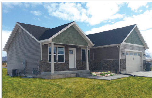
SIDING WITH 3 FT WAINSCOT AND 2 FT KICKBACK ON FRONT ONLY