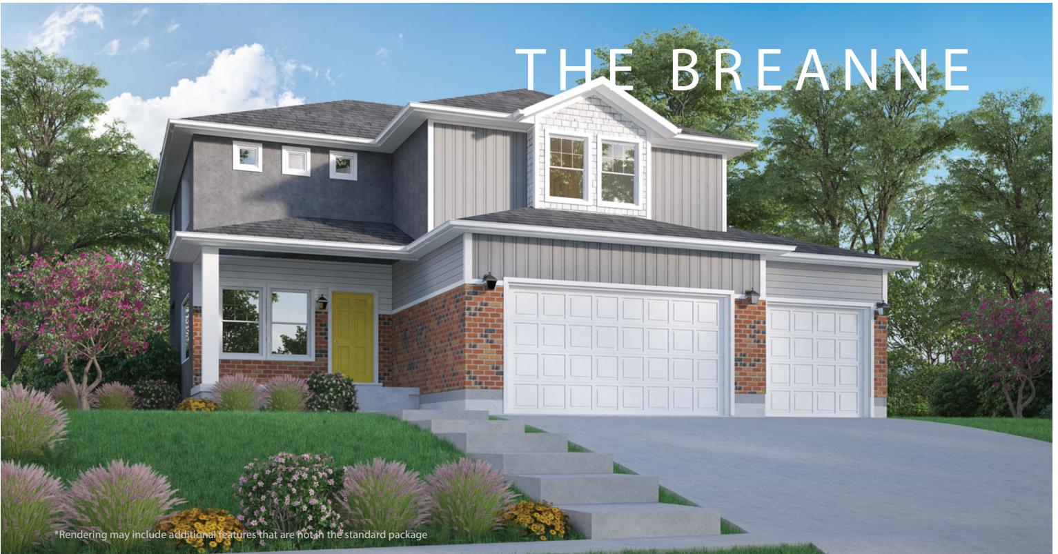
*Rendering may include additional features that are not in the standard package