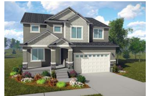
Kellie Color #6