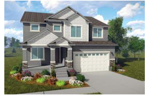
Kellie Color #3