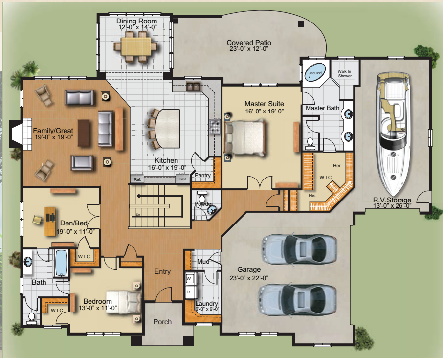
Main Level Floor Plan