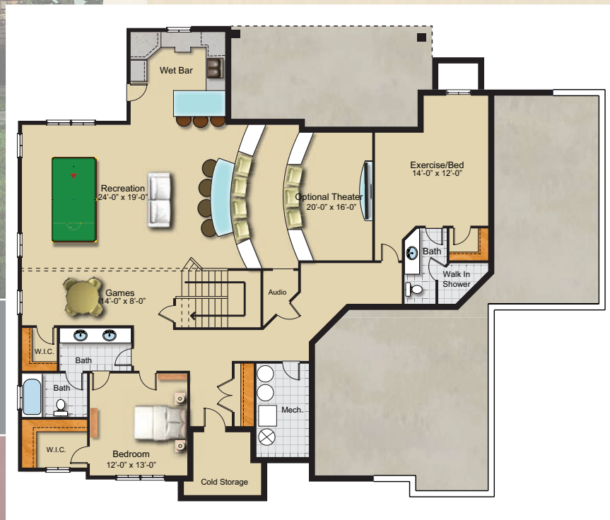
Optional Basement Level Floor Plan