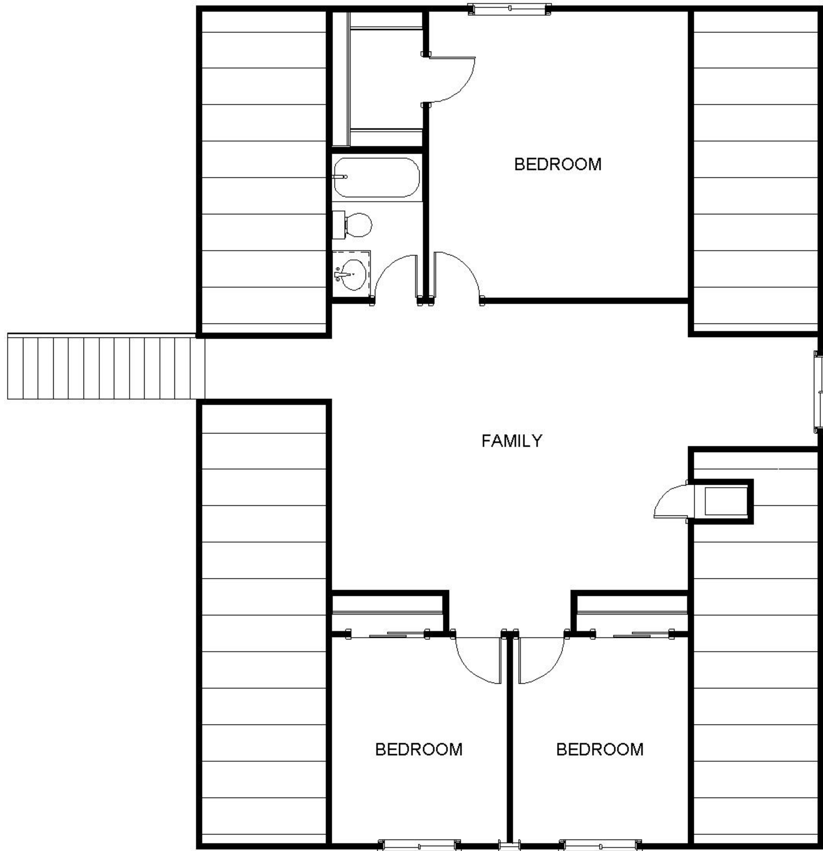
UPPER FLOOR PLAN 1005 SQUARE FEET