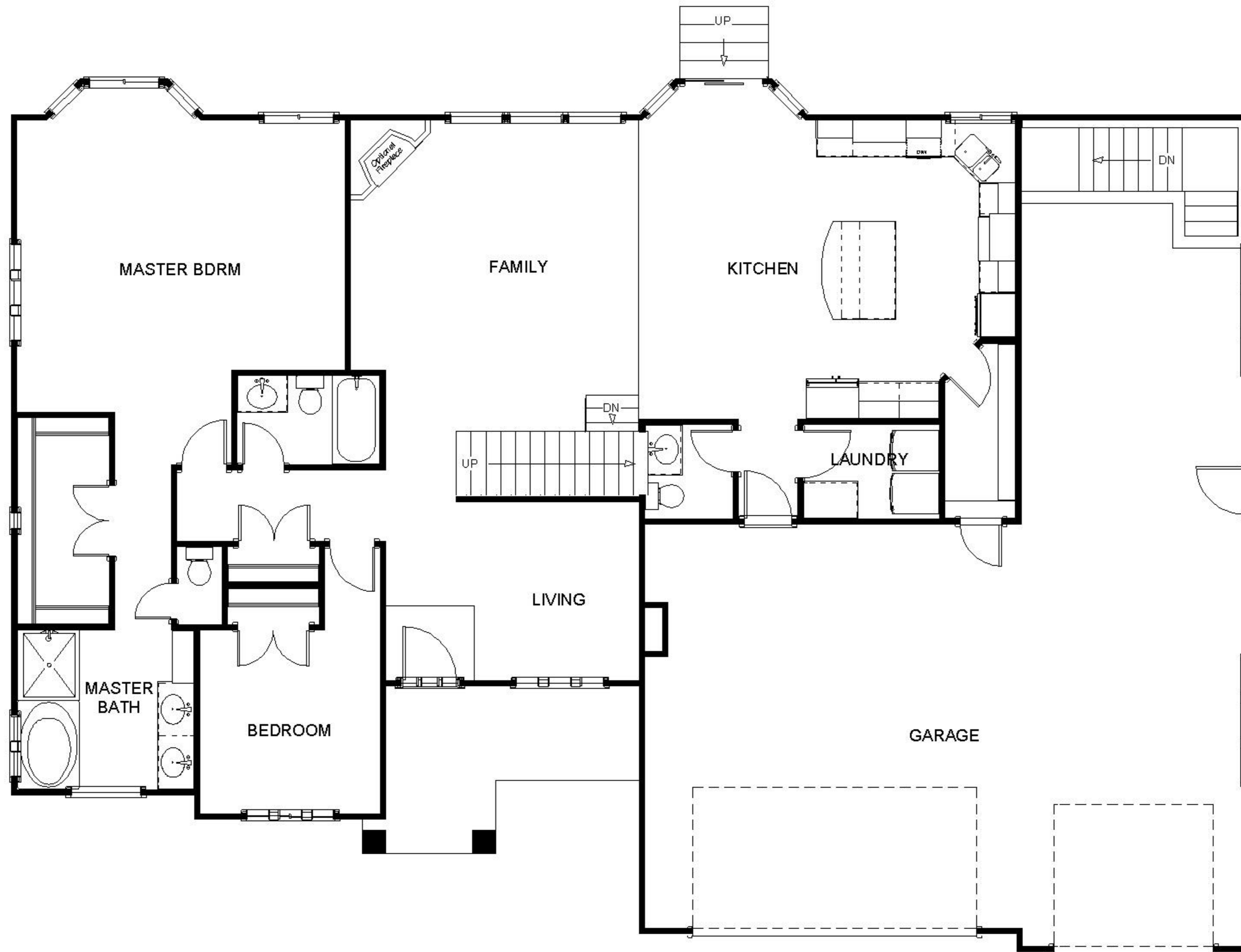
MAIN FLOOR PLAN 1819 SQUARE FEET