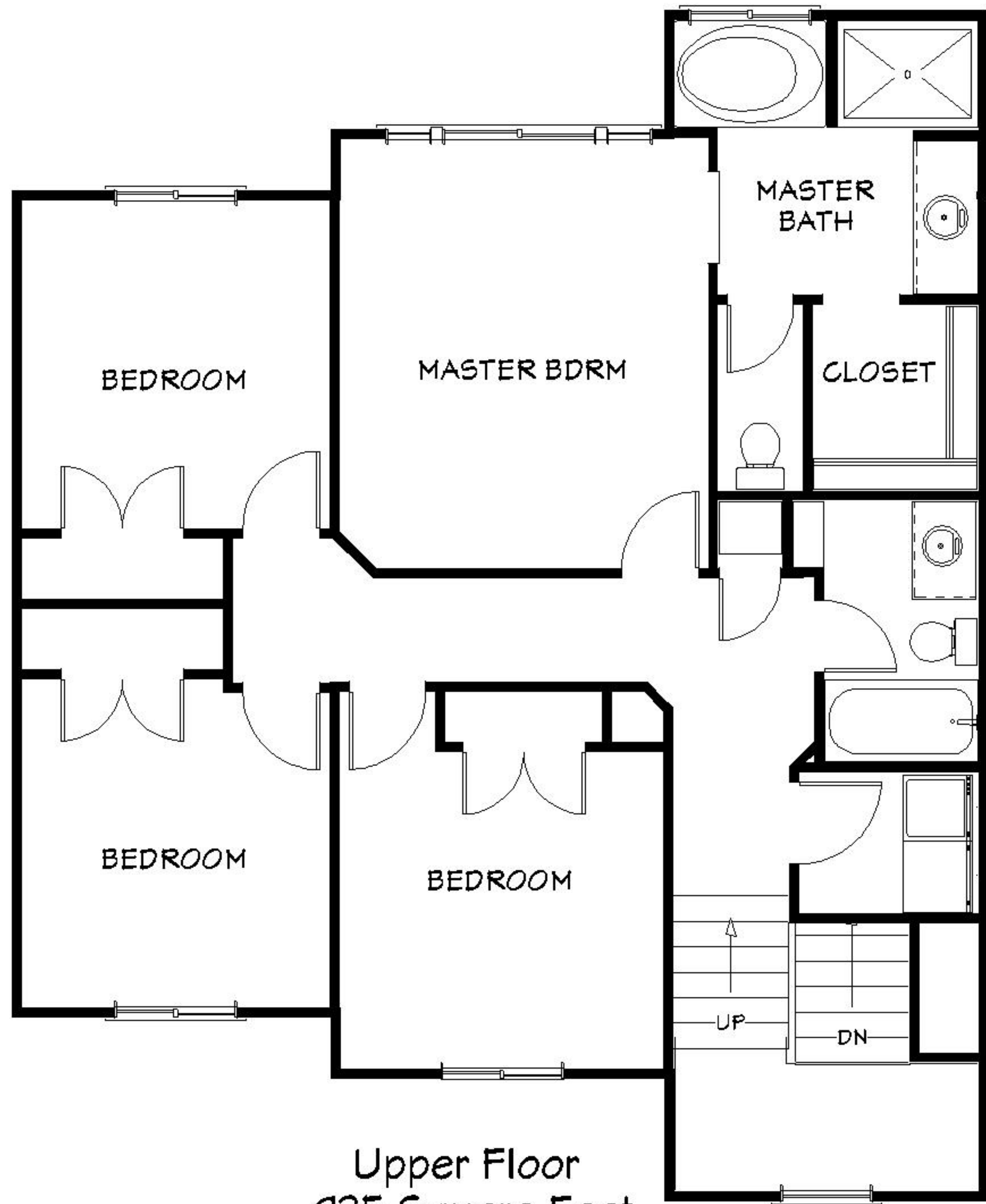
Upper Floor 935 Square Feet