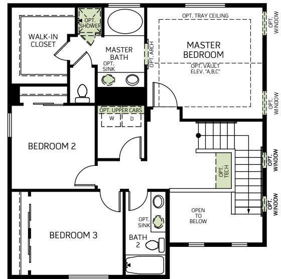
SECOND FLOOR 908 Sq. Ft.