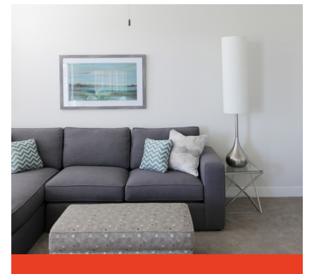
Exterior and Interior pictures of a townhome with a similar floor but are of a different townhome in a different community. The actual home may differ in color/materials/options. Pictures may feature upgrades not included in the base price.

Granite or quartz counter-tops throughout