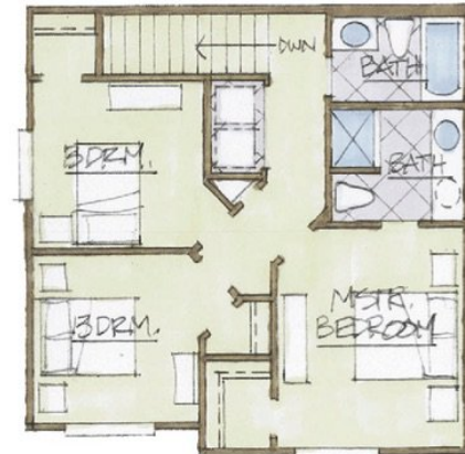
THIRD FLOOR | 663 SQ. FT.