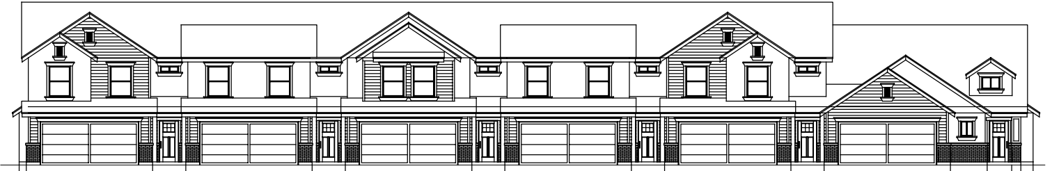
OVERALL FRONT ELEVATION